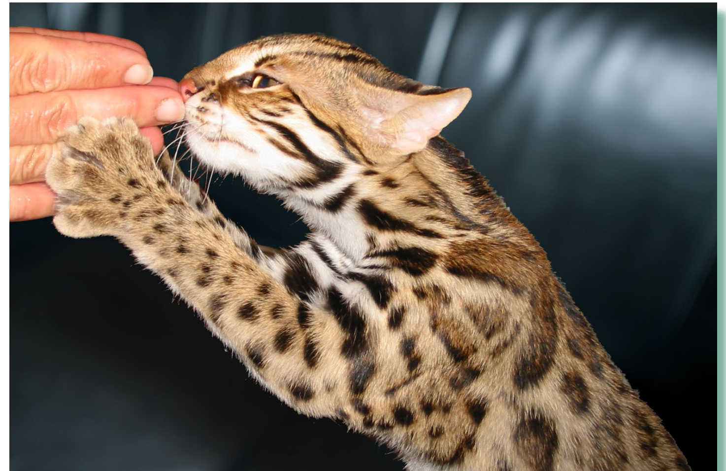
Profile: Curve of the forehead should flow into the bridge of the nose with no break. This ALC shows perfectly what we are looking for.