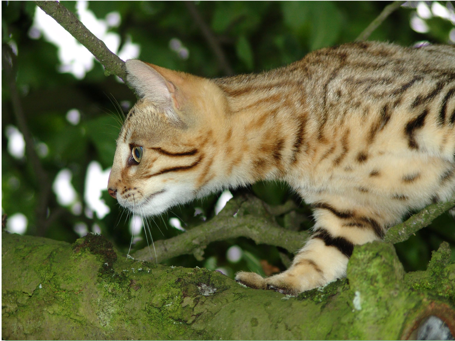
RW SGC Spice Sedano shows a beautiful profile.

do with the fact that these very shy wildcats are usually stressed in the vicinity of people, and therefore we hardly ever get to observe them in a relaxed posture. As soon as a Bengal or any other domestic cat feels threatened, it moves in a very similar way. For the present article, we consciously selected only ALC and F1 pictures which show relatively calm animals. It seems that in this case the posture of an ALC does not differ substantially from that of a Bengal.